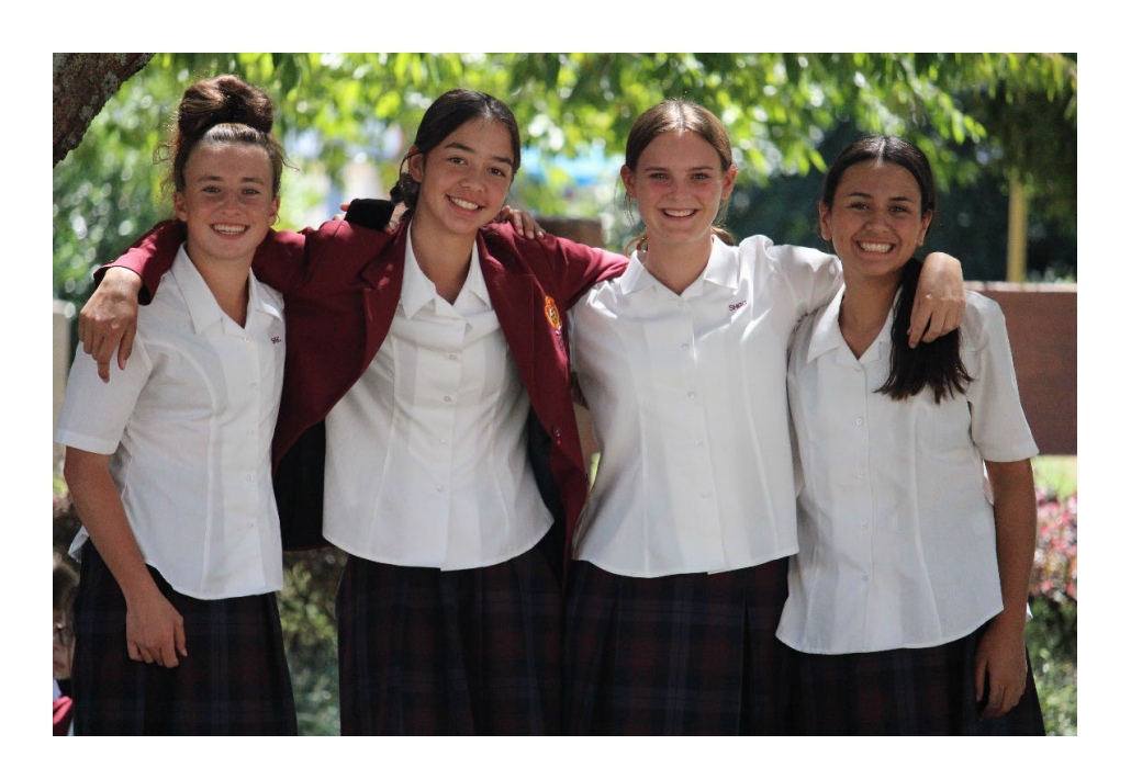
Our Vision Statement

The International Team and the Sacred Heart Girls' College (Hamilton) community.